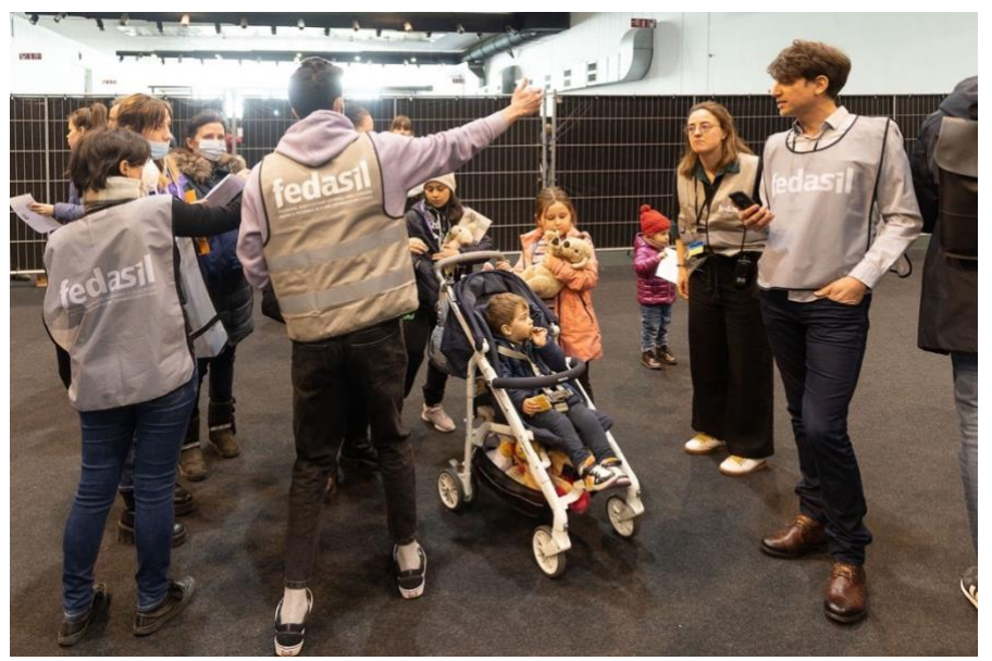
Ukrainian refugees arrived in Belgium

By Fatih Yilmaz<sup>2</sup>, Samet Coban<sup>3</sup>